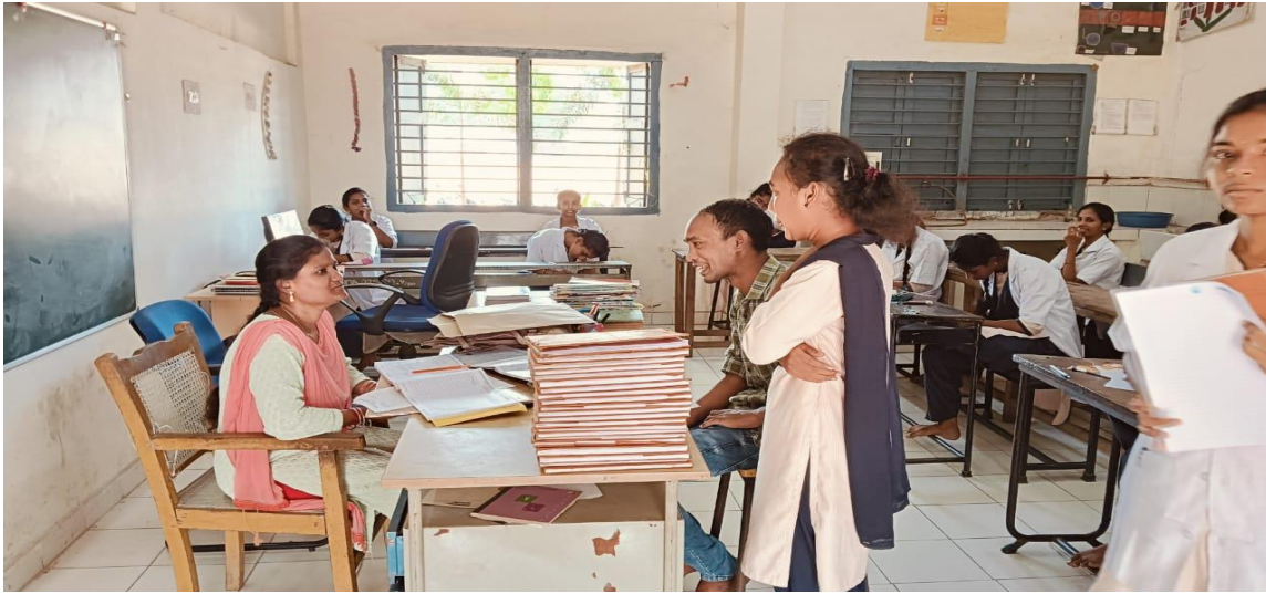
DOING PERSONAL COUNSELING TO THE GIRL STUDENT AND PARENTS IN THE MICROBIOLOGY DEPARTMENT