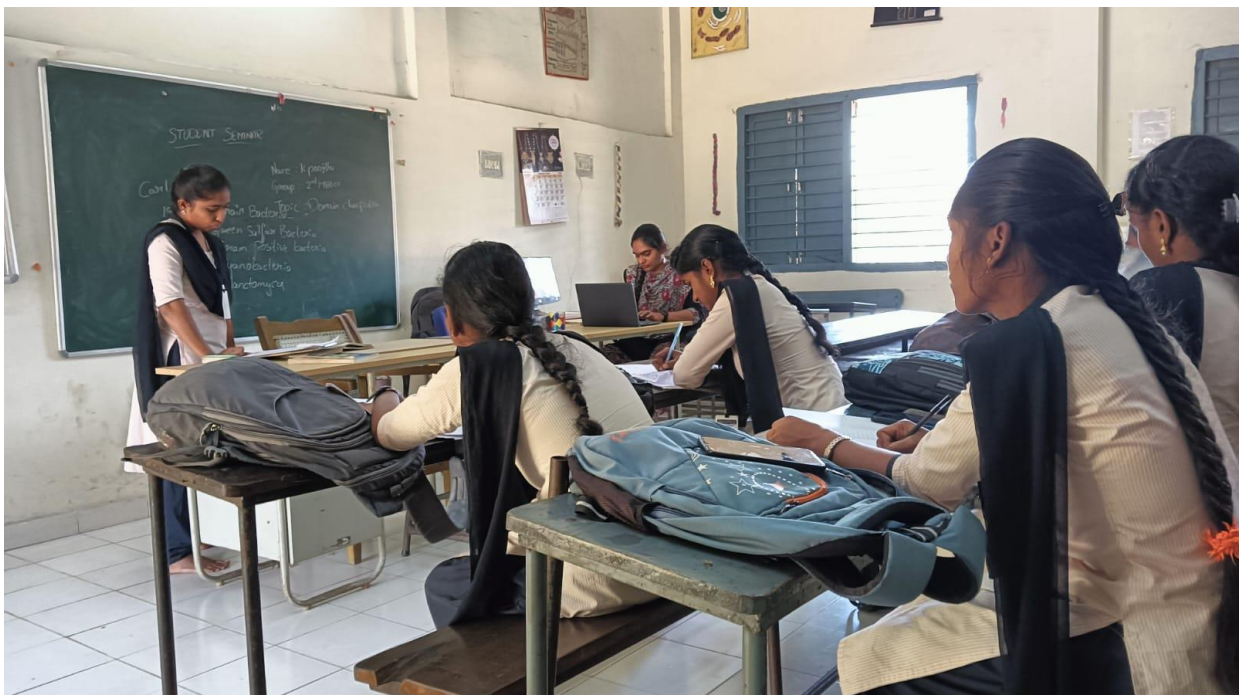
ENCOURAGING PREE TEACHING TO BUILD LEADERSHIP SKILLS AND CONFIDENCE