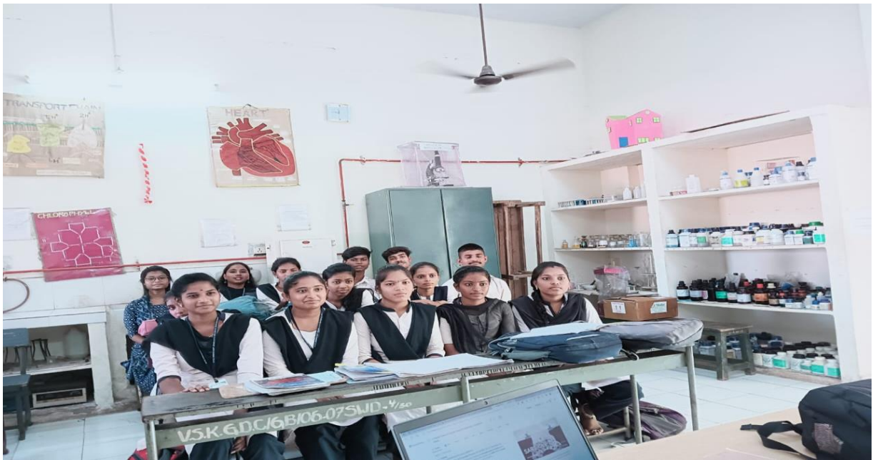
TAKING EXTRA CLASSES FOR SLOW LEARNERS UNDER REMEDIAL COACHING