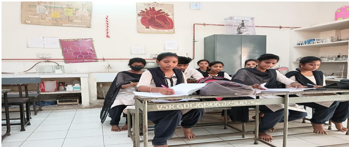
TAKING EXTRA CLASSES FOR SLOW LEARNERS